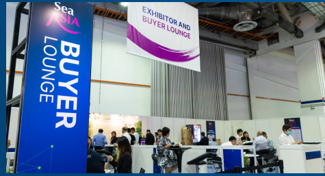
Exhibitor & Buyer Lounge