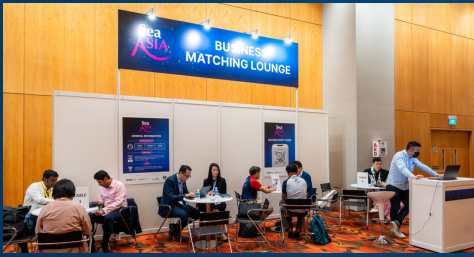
Business Matching Lounge